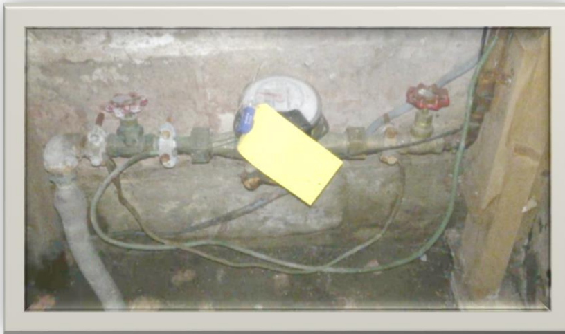
Residential Service Line Image

The City of Warren has some lead service lines (LSL) delivering water to homes throughout the City's water distribution system. These homes with a lead service were built before the 1950's and normally found in single family residents.